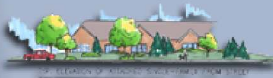
CROSS ELEVATION OF ATTACHED SINGLE-FAMILY FROM STREET