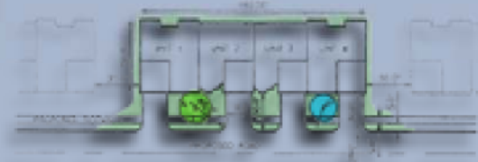
TYPICAL 4-UNIT CONDO BUILDING (272 UNITS)